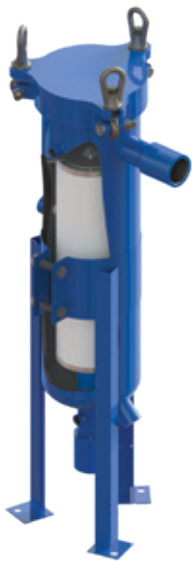
Series 55C with Legs

The Chemelean vessel and cartridge line offers versatility to adapt to a wide variety of process liquid applications up to 200 gpm. The vessel comes in two sizes to hold either a 20" length cartridge or 40" length cartridge. Chemelean cartridges come in a wide range of media choices for suitable fluid compatibility.