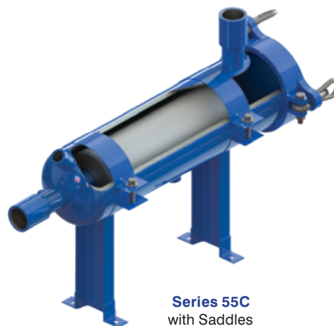
Series 55C with Saddles